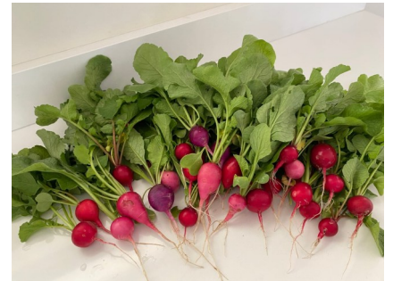
Easter Egg Radishes From Botanical Interests Seed Co.

Don't wait until the seed racks are picked over and the online companies start marking the most popular varieties “sold out”. Sketching out a garden plan, making decisions and purchasing seeds are the joys of late winter.