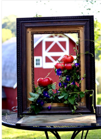
'Grandpa Ott's' Morning Glory and 'German Pink Tomato' pose for the 2025 catalogue photo shoot at the Seed Savers headquarters in Iowa.

Varieties which are becoming rare or have special characteristics that make them desirable for preservation are most