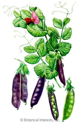
Sugar Magnolia Snap Pea - Botanical Interests

Just for fun, click on this link to a recent Seattle Times article titled "Sowing Hope: The Secret World of Seed Catalogs" https://bit.ly/3Otz9vg . (Be aware that this was written for gardeners in the moist Pacific Northwest. Much of it is helpful, but some of the advice is not a good fit for our high and dry Colorado gardens.)