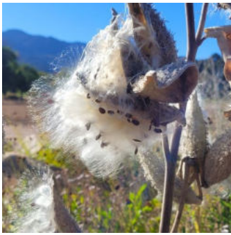
Milkweed Seed Pods on the Island