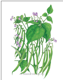
Blue Lake Bush Bean Botanical Interests

Beauty Beyond Belief (BBB) (Boulder) A small farm offering a wide variety of heirloom, organic, open-pollinated vegetable, flower and wildflower seeds. https://bbbseed.com/