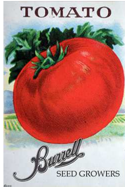
Better Boy Tomato (Hybrid) Burrell Seed Growers

Burrell Seed Growers, LLC (Rocky Ford) This company, which has been producing and selling seed since 1900, is dedicated to preserving heirlooms and open-pollinated seeds. They proudly offer generous sized seed packets at modest prices. Antique drawings of vegetables grace some of their seed packets. https://burrellseeds.us/